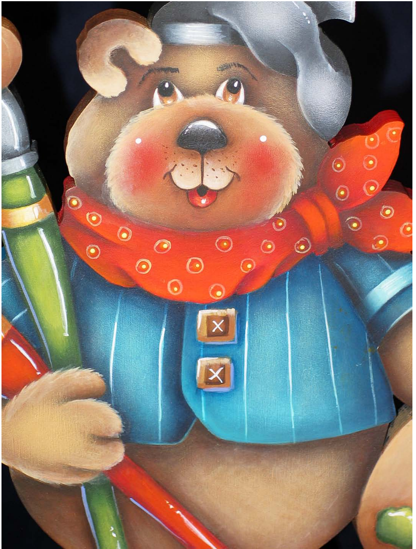
Copyright by Kay Quist/Kay Quist Creations. For your own use, please do not distribute or make copies.