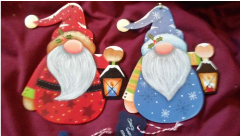
The above photos courtesy of Helen and her busy paint brush.