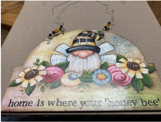
Painted by Bobi Trani