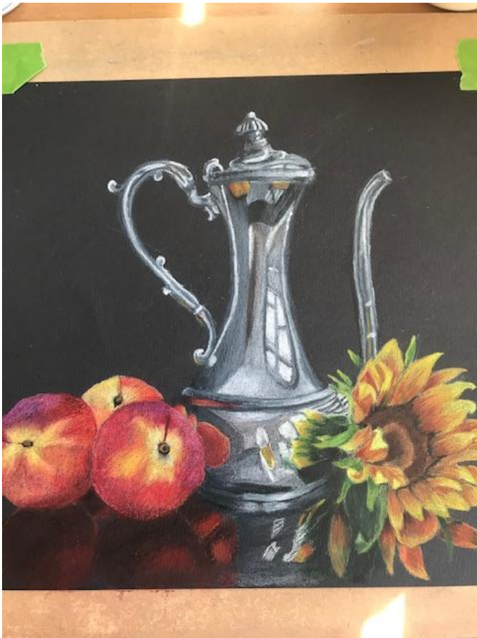
Painted By Nancy Welch